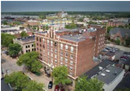
The Warm Friend 5 E 8th Street, Holland, MI

These communities are based on a reimagined vision of retirement living—and inspired by how seniors want to spend their best years. We provide innovative solutions for serving our community through these new developments.