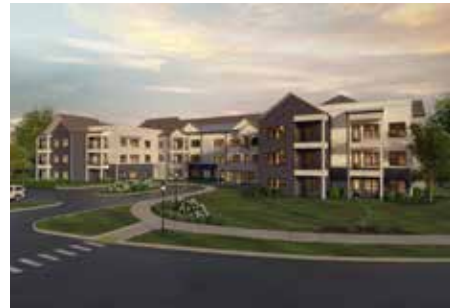
The Farmstead 558 E. Greenwood Circle, Holland, MI