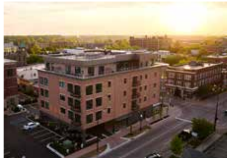
The River Place 212 S River Ave, Holland, MI