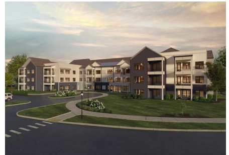
The Farmstead 875 E 24th St, Holland, MI