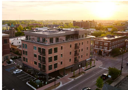
The River Place 212 S River Ave, Holland, MI