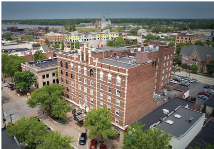
The Warm Friend 5 E 8th Street, Holland, MI

These communities are based on a reimagined vision of retirement living—and inspired by how seniors want to spend their best years. We provide innovative solutions for serving our community through these new developments.