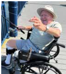
Daily life at Resthaven campuses.