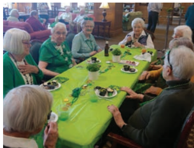
Daily life at Resthaven campuses.